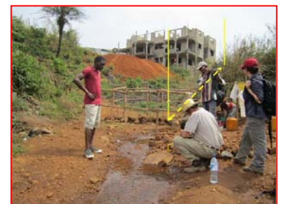
Garden Spring analysis

Baoma community has been remote for decade. No water and sanitation facilities are available. Their main drinking point is from an unprotected spring which turns dry at the peak of the dry season and the bush and nearby houses are used as latrines to defecate. For the school children to practice proper hygiene process there is a need for a latrine to be built and to provide basic water supply facility in the Baoma Community in Freetown. Quite recently we have developed the water component to include the expansion of an existing Garden Spring which runs right through the dry season. We are presently working on doing boring samples before the actual can start in summer.