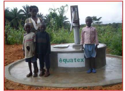
Completed Community Hand Dug Well at Hangha, in the Kenema District, Sierra Leone

Parallel to the improved water supply on this project the project aims at introducing Ventilated Improved Pit (VIP) latrines on the basis of Community Lead Total Sanitation (CLTS) in the mentioned 3 villages. CLTS is basically a sanitation strategy being promoted by UNICEF where communities are triggered to make a change for themselves. In this regard, and looking at the limited time frame for the project, we hope to offer support to the communities to enhance a project acceptance and on the other hand designing a simple more affordable latrine design that will be built with little or no subsidy.