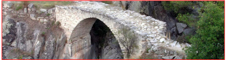
Old stone bridge in Zovic, Macedonia