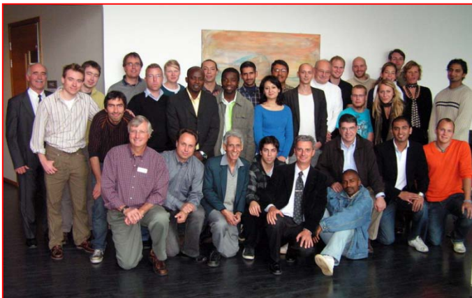
EWB-International Conference – Sweden, September 2008

The EWB-I Board has decided that Member Associations have to pay a fee to be members of EWB-I. The fee will contribute to the cost of running EWB-I covering among others conferences, annual general meeting (AGM), web-site, newsletters etc. The Board also has the intention to subsidize less well-to-do MA's participation in conferences and AGMs.