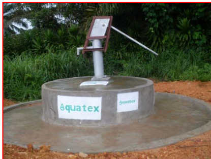
Completed Community Hand Dug Well

The main objective however is to achieve an Open Defecation Free (ODF) society with little or no subsidy. The process entails various training sessions to go through the triggering cycle. The project aims at contributing to the improvement of the health and water situations for the poor in the rural areas by providing improved water supplies facilities by, rain water harvesting, and protected hand dug wells and improved sanitary facilities, which also serve to protect the existing well water supplies. In particular children and the elderly will benefit from these means to prevent diarrhoeal diseases. IUG and EWB SL will introduce improved technical solutions in the field of rain water harvesting applied in other development projects in Africa and elsewhere.