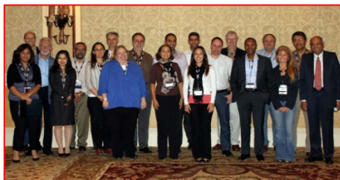
EWB-International Board Meeting Las Vegas, March 2012