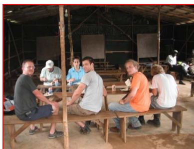
Baoma Water and sanitation Project

Baoma community has been remote for decade. No water and sanitation facilities are available. Their main drinking point is from an unprotected spring which turns dry at the peak of the dry season and the bush and nearby houses are used as latrines to defecate. For the school children to practice proper hygiene process there is a need for a latrine to be built and to provide basic water supply facility in the Baoma Community in Freetown. Quite recently we have developed the water component to include the expansion of an existing Garden Spring which runs right through the dry season. We are presently working on doing boring samples before the actual can start in summer.