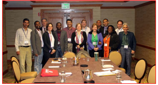
EWB-International Board Meeting – Denver, March 2010

(Refer: http://ida.dk/sites/english/Sider/IDA.aspx )